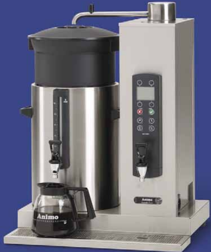
ComBi-line with a 10 litre container positioned on the left and a separate water boiler in the unit: CB 1x10W L.

In addition to this user menu, the control panel also provides access to the operator and service menus. These menus can only be accessed with a PIN code. They include the settings for controlling the coffee brewing process, the separate boiler and for service and maintenance.