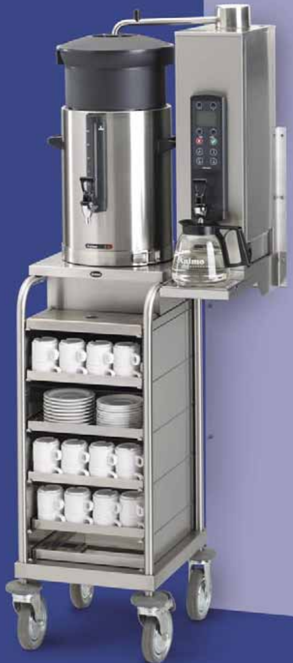
CB 10W mounted on the wall.

The Animo ComBi-line also offers the perfect means of serving coffee and tea in different places. An ideal set-up is the combination of a wall-mounted flow water heater with a container and a serving trolley. When the coffee or tea is ready, you can remove the filter and place the lid. The insulated lid makes the container safe to transport.