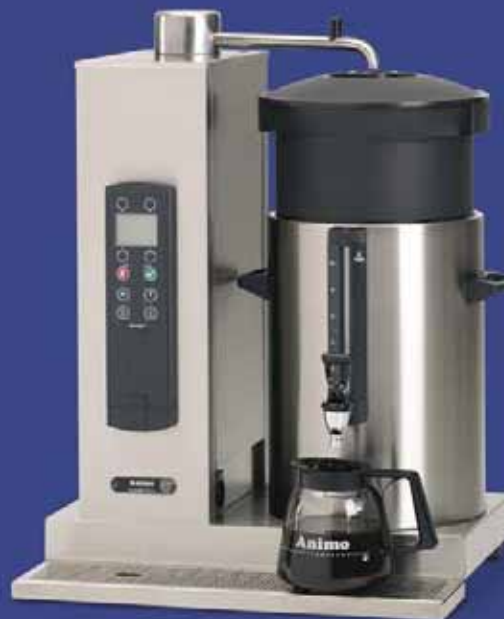
ComBi-line with 10 litre container positioned on the right: CB 1x10 R.