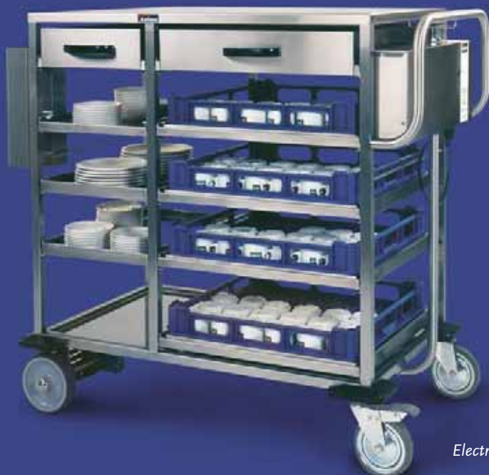
Electric serving trolley.

The combination of a ComBi-line machine and an Animo serving trolley is also ideal for the coffee and tea distribution in hospitals and residential homes. Animo offers a wide range of trolleys. Varying from a simple trolley for one coffee container to a very highly specified electrically-powered trolley for two coffee containers. We would be pleased to inform you about the possibilities.