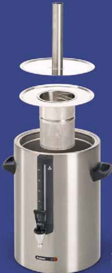
For brewing tea in a container, you can make use of the special tea filter and filling pipe.