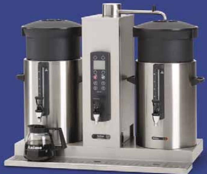
Model with two containers of 10 litre and a separate water boiler in the unit: CB 2x10W.